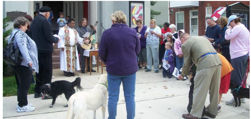
Blessing of the Animals 2010